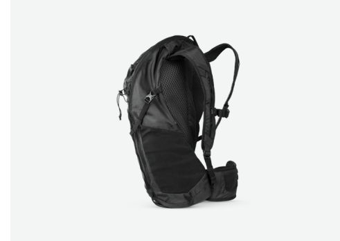
TWISTABLE INTERNAL FRAME